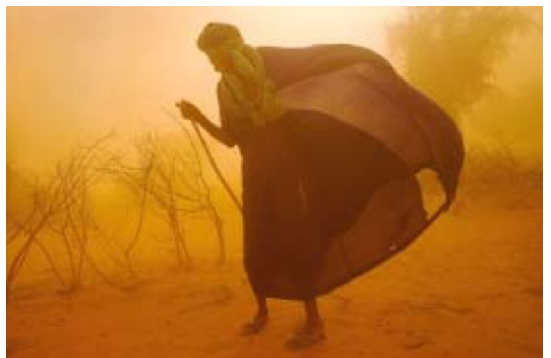
Lake Banzena, Gourma Region, Mali.